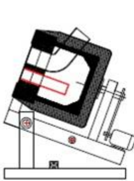
Loading position door folded