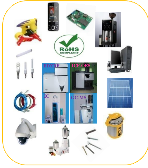
RoHS Testing facility

*Admissions: On first come first serve basis, Subject to submission of Aadhar card and Caste certificate issued by MRO, Please send e-mail to rambabu@cmet.gov.in for admission